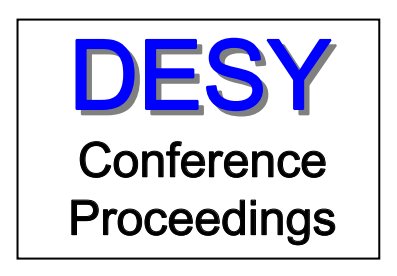
Figure 1: DESY Conference Proceedings Series.

Figure 1 shows an example of a figure and related caption. Do not use too small symbols and lettering in your figures. Warning: your paper will be printed in black and white in the proceedings. You may insert color figures, but it is your responsibility to check that they print correctly in black and white. You may submit an additional black and white version. The color version will be used for the electronic proceedings available on the web. Text may float around figures and tables (use wrapfigure or wraptable instead of figure or table as shown in the example Table 1. Of course you can also use the normal style.